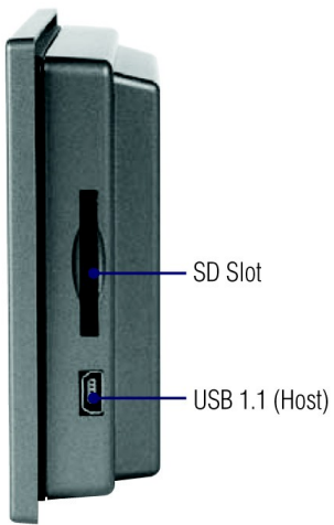
SSH-30Cx: Side View